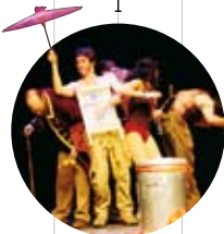
Brooklyn on Foot theater company

NEW ORLEANS The Big Easy honors the famed playwright who called the city his spiritual home with five days of literature, theater, music, walking tours and other special happenings. Notable authors—including Pulitzer Prize-winners Richard Ford and Rick Bragg—come together for panels and lectures, while a one-act-play competition will satisfy the drama-loving set. www.tennesseewilliams.net